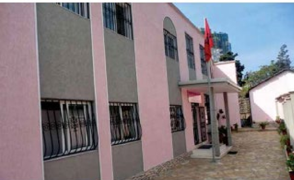
3. Medreseja e Durrësit "Mustafa Varoshi"