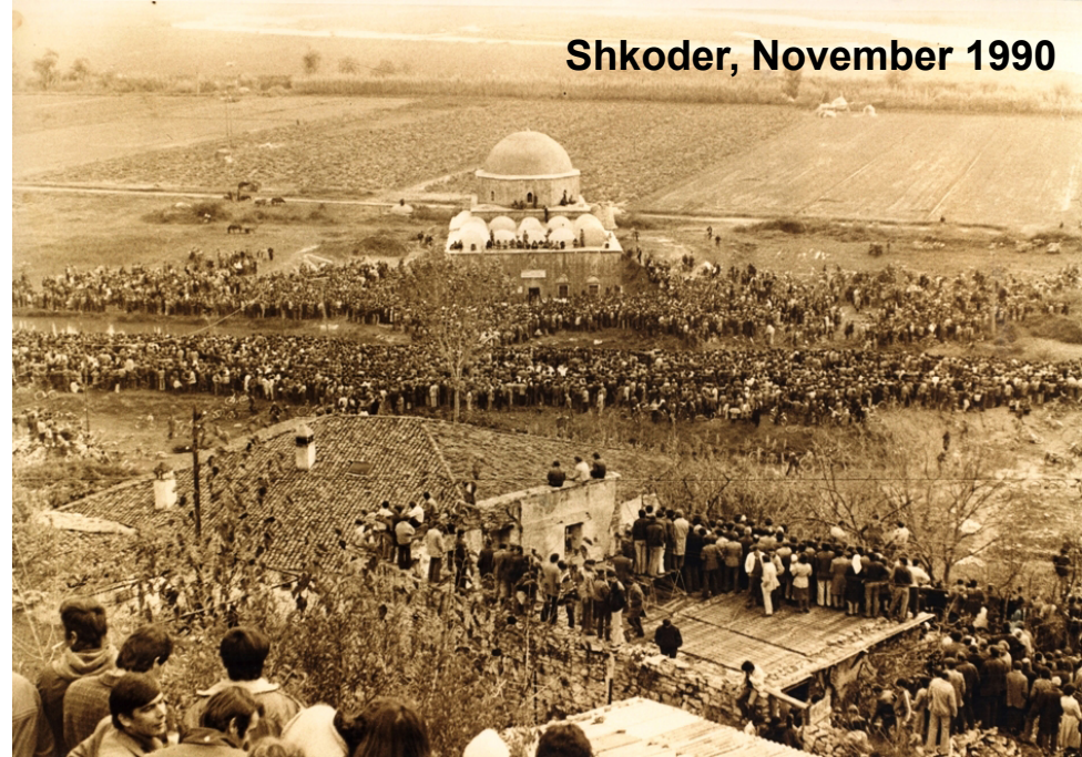
Shkoder, November 1990