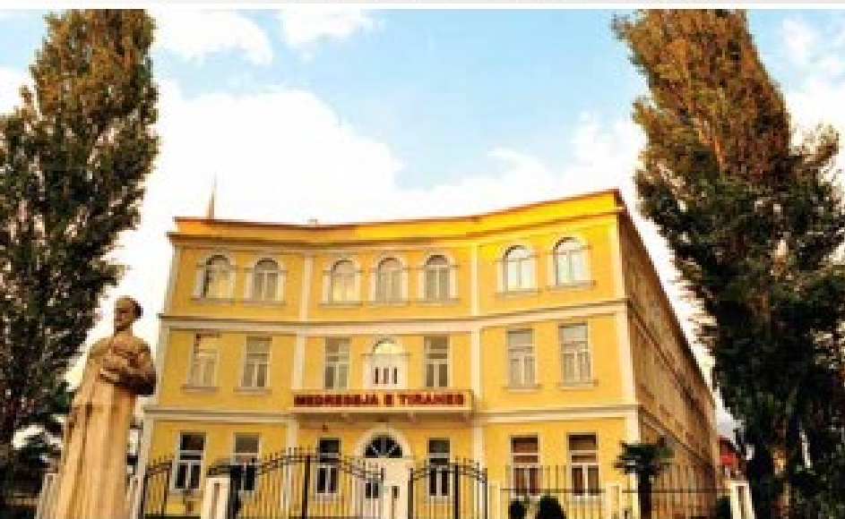
1. Medreseja e Tiranës "H. Mahmud Dashi"