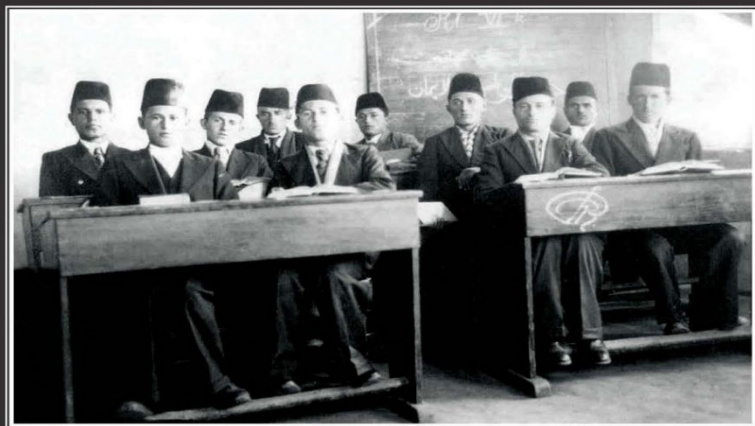
Studentë të Medresesë, viti 1932.