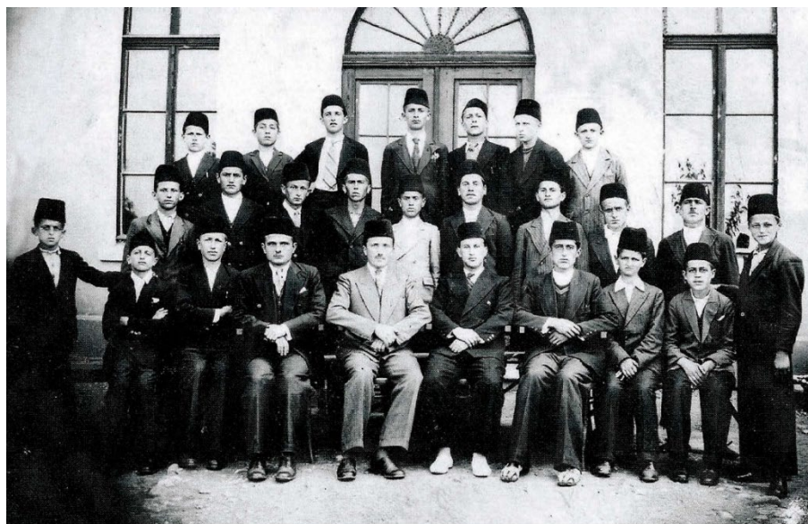
Studentë të Medresesë, viti 1934-1935.