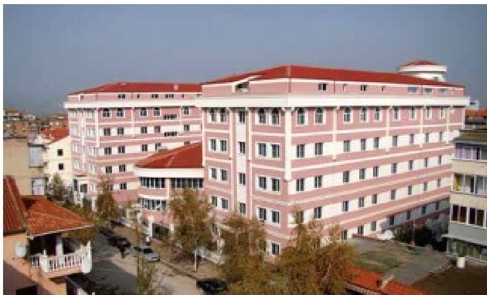
4. Medreseja e Korçës "Abdullah Zëmbaku"