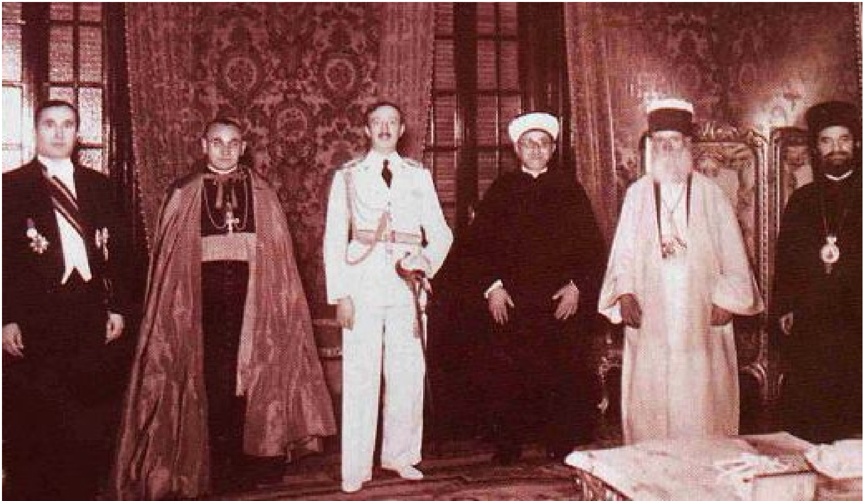
Leaders of religious communities with King Zog