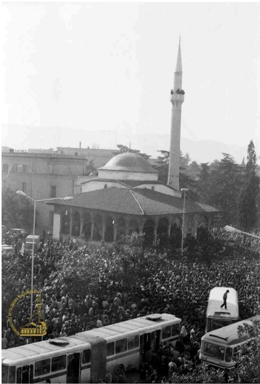
TIRANA, JANUARY 1991