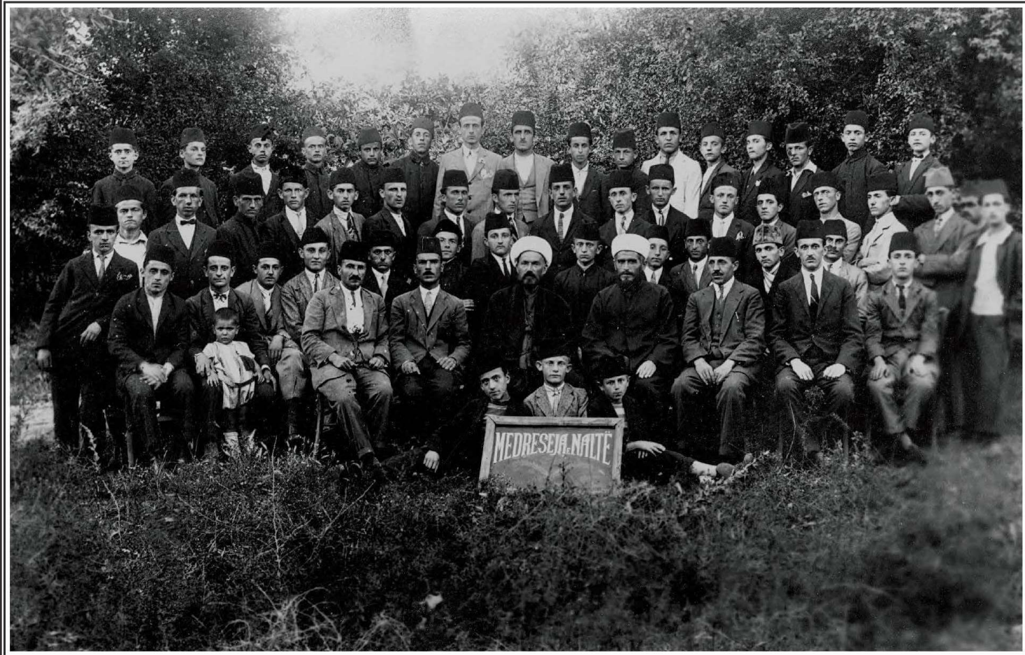
New Madrasah of Tirana, 1924